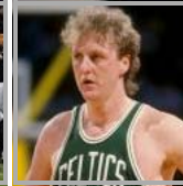
Building Celtics Best All-Time Starting Lineup