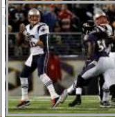
iggest gths, sses so ir