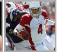
Patriots Must Improve Their Pass Rush